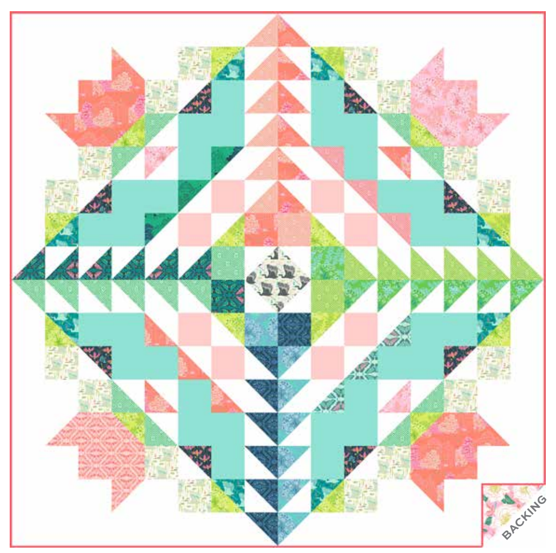
Flouirsh Quilt designed by: Patty Sloniger Quilt Size: 64'' x 64'' • Skill Level: Intermediate